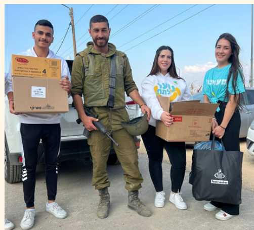
10/19- Latet Youth distributing supplies to soldiers on base in the North

Since the beginning of the war, our Latet Youth groups have been in action to contribute to the emergency efforts around the country, regardless of religion or location. The Latet Youth branches in Peki'in, Kisra, Kfar Samia and Beit Jan – in cooperation with other local youth groups and councils– conducted a drive to collect food, care packages and equipment for soldiers, packing them and sending them to the South. The Beit Jan and Ma'ar branches also packed equipment for the soldiers in the North and delivered it personally. Furthermore, our group from Migdal Ha'emek ran a fun day for 100 children, displaced from the South, with sports, art and music activities.