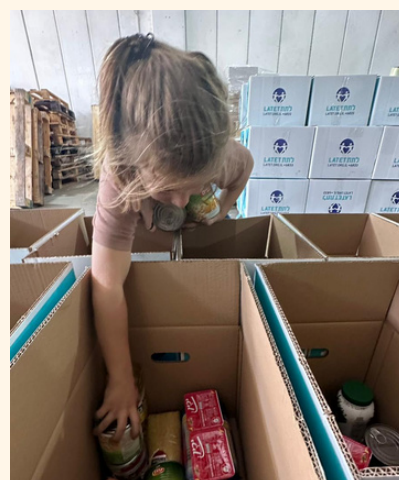
10/22- Our youngest volunteer packing boxes for Holocaust survivors